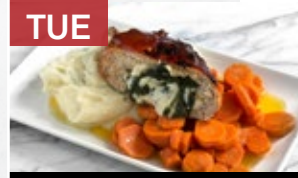
TURKEY & SPINACH MEATLOAF