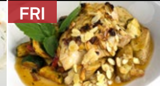
HONEY ALMOND CRUSTED CHICKEN