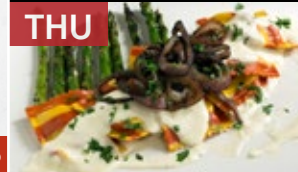
LOBSTER & CRAB RAVIOLI