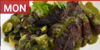
CHARRED SKIRT STEAK

a complete chef-prepared dinner for two with entrée, sides & dessert for just $18 99